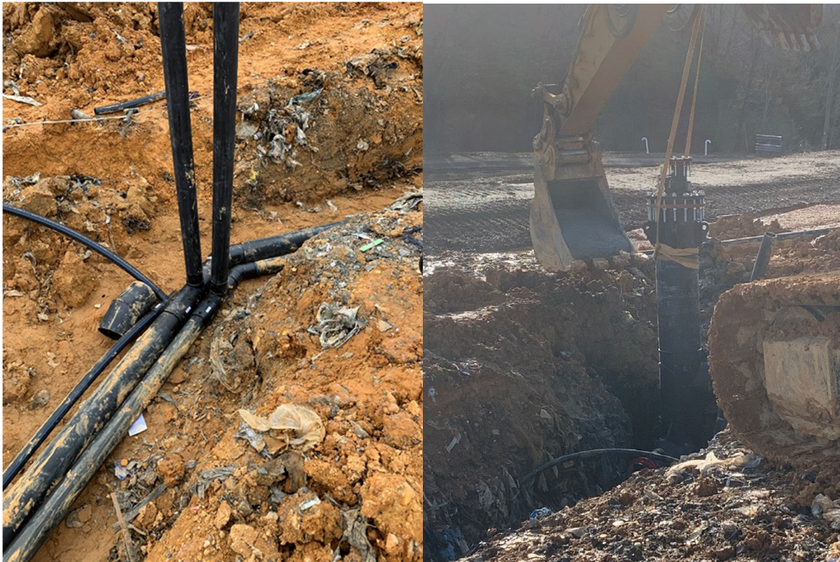
Figure 1. Landfill Gas Installation Progress - SWP No. 498 Landfill

Construction progress during January included installing landfill gas header, airline, and force main. Figure 1 shows electrofusion couplings used to connect the landfill gas pipes (left) and the installation of the new condensate sump (right). Rain and snow accumulation (see Figure 2) resulted in a construction delay between January 12, 2024 and the end of the month. The contractor reported 20 construction days lost due to weather conditions during the month of January.