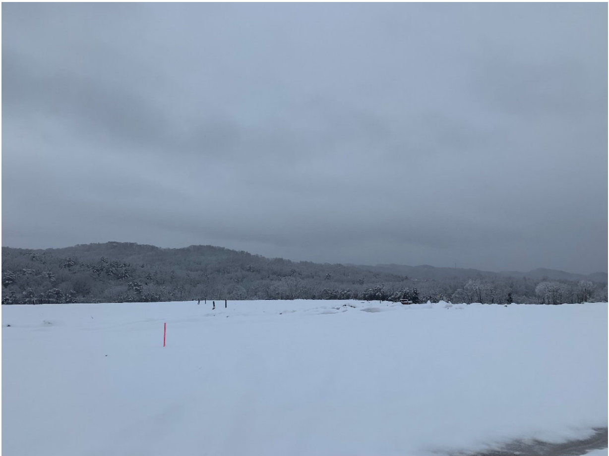
Figure 2. Site Condition on January 16th