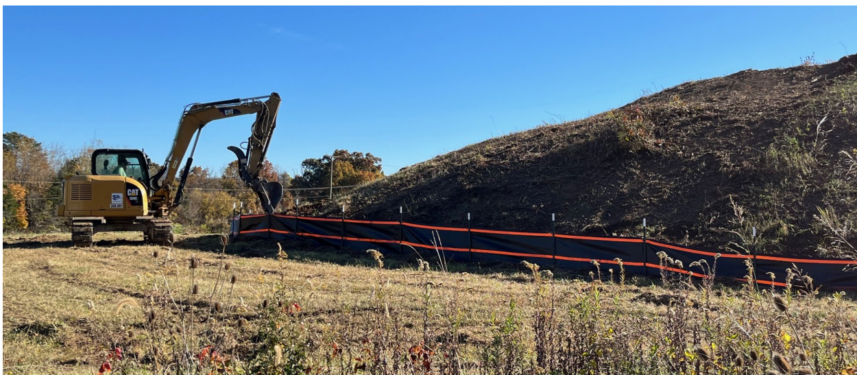
Figure 1. Installation of Silt Fence at the SWP No. 498 Landfill

BCS has mobilized to the site and construction is currently ongoing. Initial construction so far has included the installation of erosion and sediment control measures and earthwork to establish the geomembrane deployment grade. SCS has mobilized CQA personnel to the site to monitor BCS's progress. The installation of erosion and sediment control measures is shown in Figure 1.