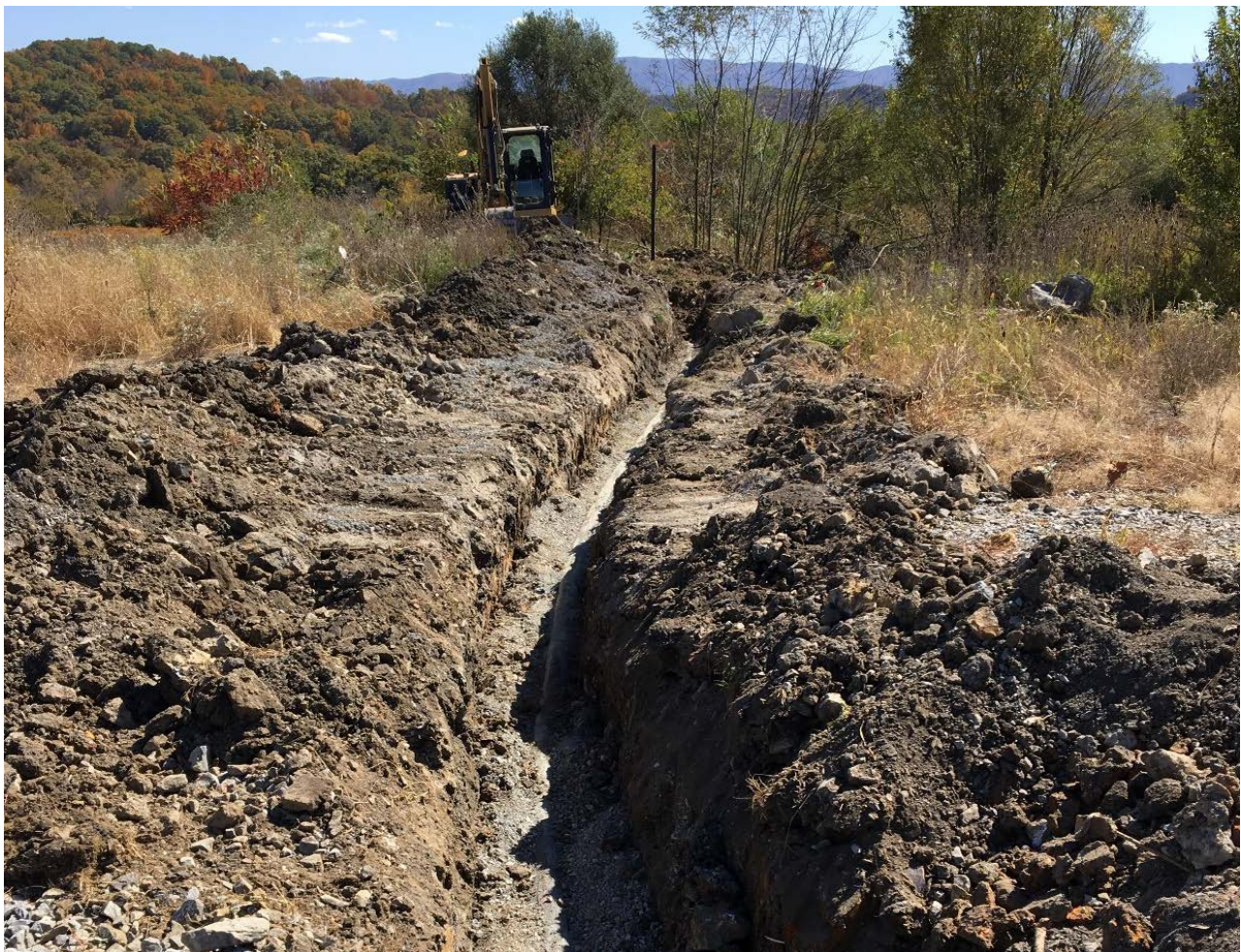
Figure 2. Photo of Troubleshooting Activities on SWP 498 GCCS

At this time, the existing gas collection wells are not under vacuum due to damage to the landfill gas collection and control system (GCCS) infrastructure. SCS began the process of repairing the GCCS during the month of October. SCS replaced a butterfly valve and began to excavate the 6 in landfill gas header in order to determine the extents of damage to the GCCS. Investigation and repairs to the system are ongoing. No monitoring of the GCCS could be conducted this month because the system was not in operation. Figure 2 shows excavation activities conducted during the month of October in an attempt to identify damage to the landfill GCCS.