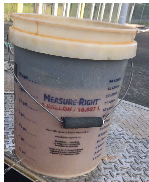
Exhibit 1. Sample Collection Method

The samples were delivered to Enthelpy Analytical in Richmond, Virginia for analysis to assess if the samples are exhibiting hazardous waste characteristics. The complete certificates of analysis (COAs), including chain-of-custody documentation, sample preservation logs, sample conditions checklists, and the laboratories' Virginia Environmental Laboratory Accreditation Program certifications, are attached. The liquid layer results are reported on COA 22E1462 and the product layer results are reported on COA 22E1464.