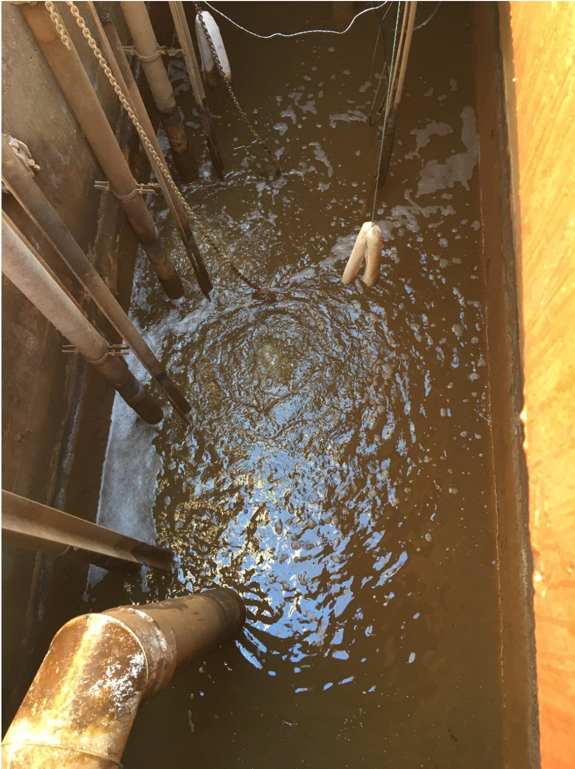
Figure 1. Photo of 498 Leachate Pump Station Tank Taken on October 20, 2022